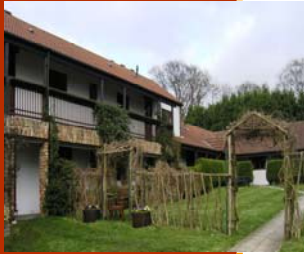
Lovely Courtyard accommodation

A three night stay including breakfast is £150 per room. Take a look at the website for the full range of activities and opportunities in the area.