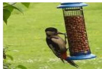
Woody the woodpecker

Rudstone also offers first-class self-catering accommodation fully serviced, including housekeeping and linen and towel changes, perfect for a group or society get together!